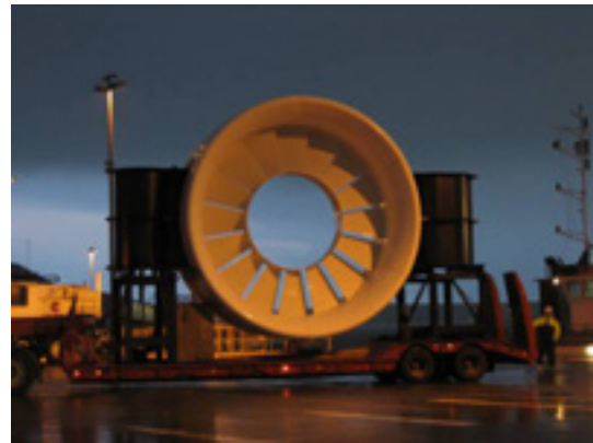
Transporting Open-Centre Turbine