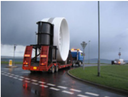
Transporting Open-Centre Turbine