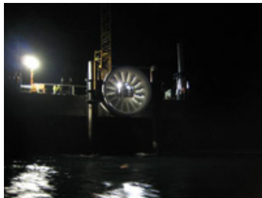
Installation of Open-Centre Turbine