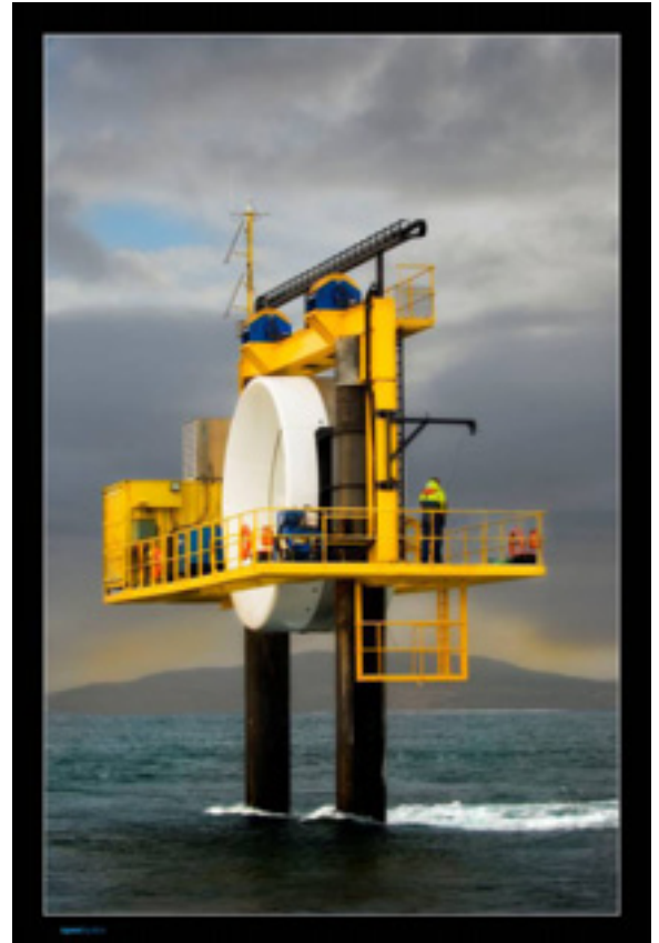
OpenHydro's turbine test rig at European Marine Energy Centre in Orkney, Scotland.