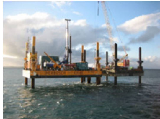
Jack-ups 'Octopus' & 'JB-107' On Station