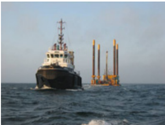
Towing jack-up barge 'Octopus' to installation site.